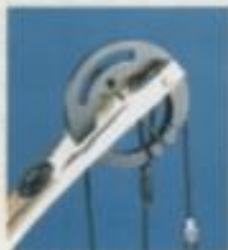
Standard 3" Adjustable Wheel