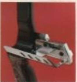
Standard -- no rest -- (Shown in chrome)