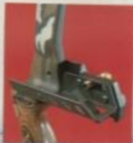
Hunter Supreme w/Plunger