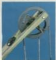
New "Fast Flight" 3" Adjustable Wheel

At High Country we believe in hunting with the heaviest bow you can shoot well. We also believe a bow should be smooth as well as fast. The answer was our 65% let-off "Impulse" Wheels. By relaxing bow weight by 65% at draw, you have the pleasure of being able to hold on target longer for a more accurate, more comfortable shooting experience. At release, the feel is crisp power and an incredibly fast, flat shooting arrow.